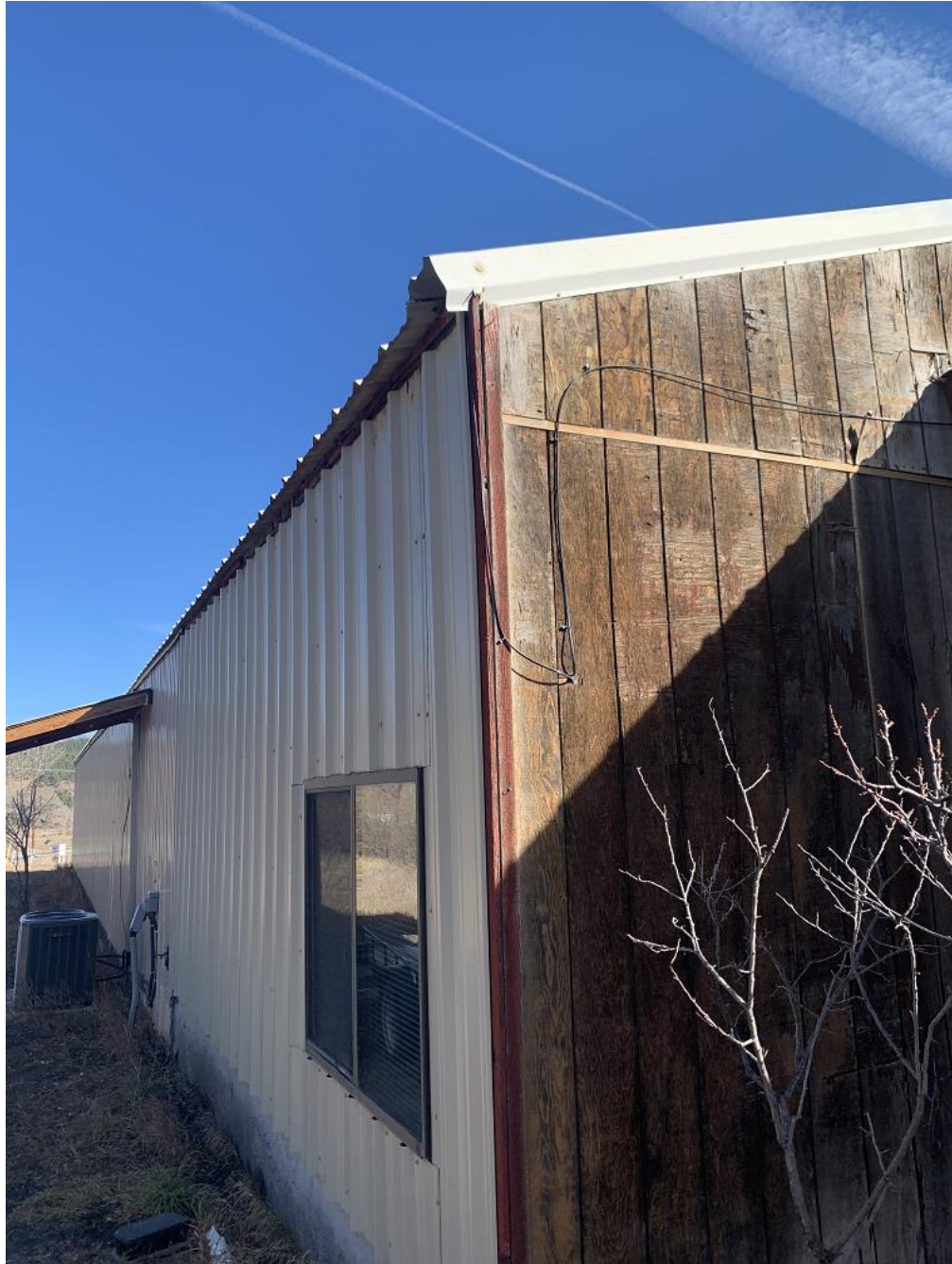
Figure 4: Extension Building Fiber - Not in Conduit