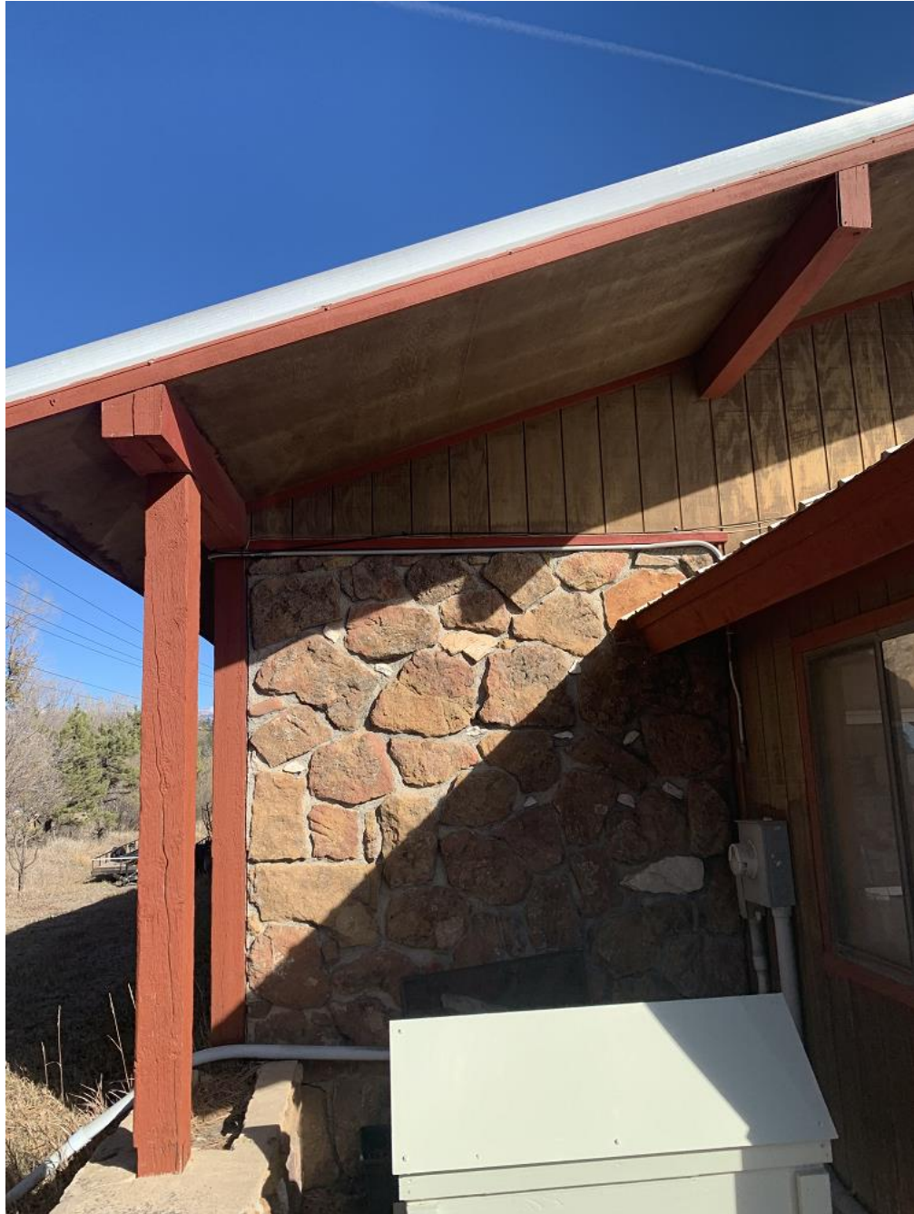
Figure 3: Extension Building Fiber - Not in Conduit