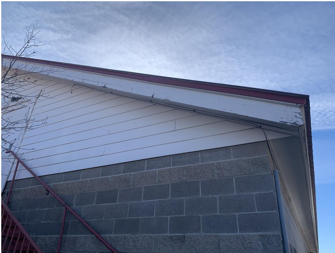
Figure 5: WHEC Building Fiber - Not in Conduit

Archuleta County Fair Board PO Box 370 Pagosa Springs, CO 81147