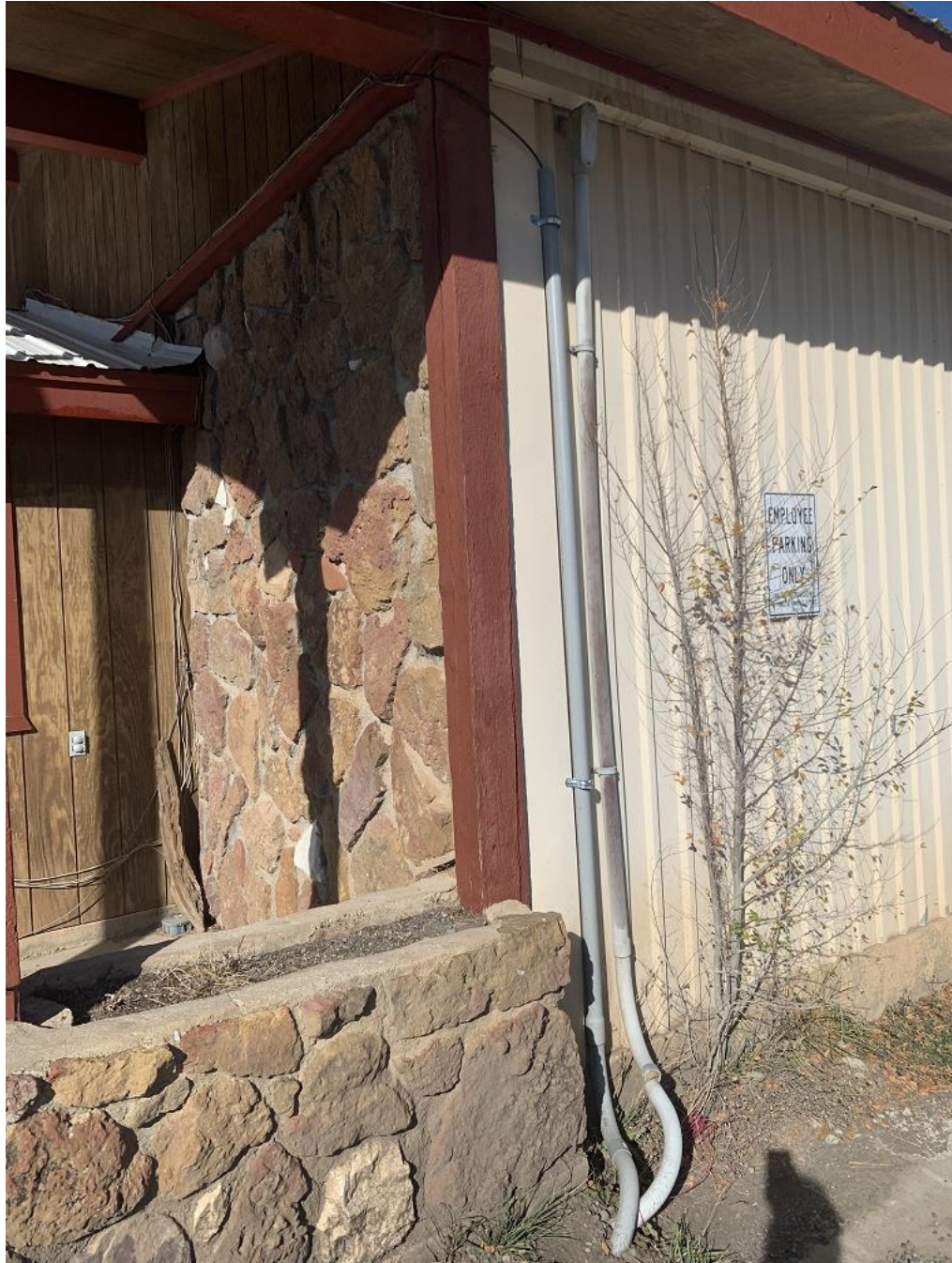
Figure 2: Extension Building Fiber - Not in Conduit